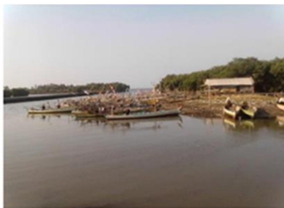
Figure 1. Sungai Gembong Estuary

Pasuruan City is located at the intersection of the main Surabaya-Probolinggo-Malang line, with a distance of 60 km from Surabaya, 38 km from Probolinggo, and 54 km from Malang. The condition of the roads in the city is quite good with an even distribution throughout the region. Connections outside Java, especially to Kalimantan and Sulawesi, can be made through ports. Currently, the Port of Pasuruan City utilizes the mouth of the Gembong River as an inter-island trading port, with the main activities focusing on people's shipping (PELRA), as depicted in Figure 2 below: