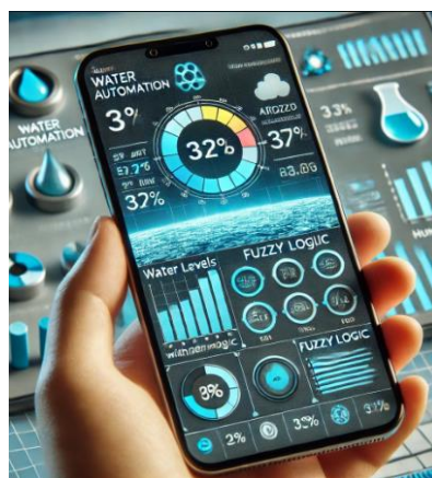
Figure 3. IoT Application View

This app interface shows the soil moisture, air temperature, and light intensity data received from the system, as well as the manual control of watering. This interface ensures that farmers or users can understand the information easily and take necessary actions quickly. The stability of the system