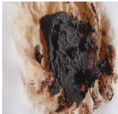
Figure 2. Coffee Grounds

On the other hand, several other studies confirm that coffee grounds also have mild antibacterial activity that can help reduce odor formation caused by microbial activity. A study conducted by Ballesteros et al. (2014) reported that coffee grounds extract has the ability to inhibit the growth of certain bacteria that produce odor-causing volatile compounds.