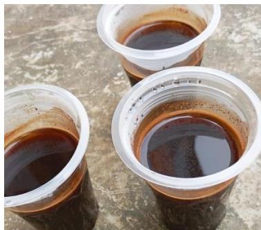
Figure 1. Coffee

Previous research by Kawasaki et al. (2006) showed that carbon material from coffee grounds has the ability to absorb ammonia gas ( \text{NH}_3 ) is higher than commercial activated carbon. This finding confirms that coffee grounds waste has the potential to be an effective natural adsorbent. Muspa et al. (2017) also reported that coffee grounds without carbonization can reduce odor in organic waste by absorbing hydrogen sulfide gas ( \text{H}_2\text{S} ).