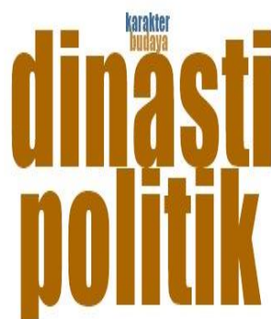
Figure 7. Word Frequency Power Aspect

In creating a credible government, power must be held by honest, trustworthy, competent, and expert people with a good, dynamic, and inspiring vision so that it can minimize the potential for conflict with the community it leads. In reality, many government administrators do not hold these principles, so they cannot align their actions with the community's expectations and needs (Kouzes & Posner, 2011). This will have an impact on the decline of the credibility of government administration. In the discussion of the aspect of power, based on the results of the research that the author has conducted, the results of NVivo are as follows: