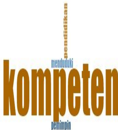
Figure 8. Word Frequency Competency Aspect

In general, the public's assessment of the competencies possessed by government administrators under the current Governor is competent, as can be seen from the results of data processing through NVivo as follows: