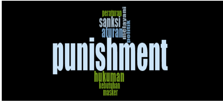
Figure 4. Word Frequency Aspects Affect

Figure 4 above explains that this influencing function can be done by motivating and empowering the community through rewards and punishments. For example, the government gives fines for not wearing masks, and shops and supermarkets that operate during operational hours during the COVID-19 pandemic immediately get punished.