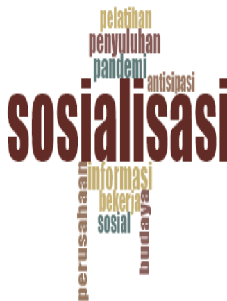
Figure 2. Word Frequency Educational Aspect

socialization ( sosialisasi ). The chart below shows that the first factors that affect government communication, in this case, the educational dimension, are socialization, counseling, and training, as shown in Figure 2 below.