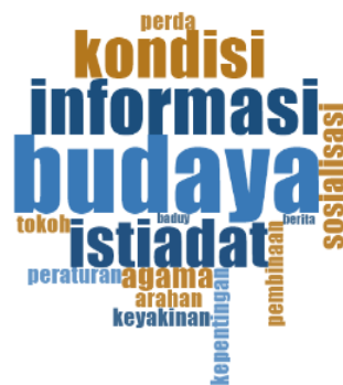
Figure 5. Word Frequency Aspects of Conveying Various Government Policies

especially in the delivery of information, the government has launched several websites, namely the Provincial Government website, the communication and information service website, the Information and Documentation Management Official website and the Banten government's flagship application such as the leadership dashboard and the Jawaara dashboard. The existence of the above website can make it easier for the public to access information and submit complaints and suggestions to the Government. The results of data processing can be seen in the image below.