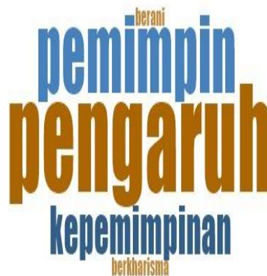
Figure 10. Word Frequency Aspect of Attractiveness

Attractiveness is one of the indicators that build government credibility. However, it is not the main thing; attractiveness can encourage people to obey the government, such as the friendliness and concern of government administrators for the community. The dominant factor that greatly influences the meaning of this attraction is the popularity of leaders in implementing local government in Banten Province. The results of the NVivo analysis that the author conducted on this attractive indicator are: