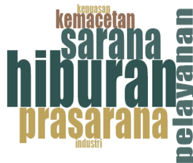
Figure 3. Word Frequency to Entertain Aspect

Province. The results of the analysis of the implementation of the communication function of the entertainment aspect can be seen below.