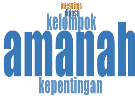
Figure 9. Word Frequency Integrity Aspect

Based on the image of the coding results above, the majority of the community gives a trustworthy answer to the integrity aspect of the local government of Banten Province. In this case, it is a mandate to the interests of community groups. Because trust is one of the indicators of integrity, this can also be seen in the ease of service in various fields, such as road construction, bridges, clean water procurement, irrigation, electricity network, access to fertilizers, gas, seeds, and agricultural products. Satisfactory work results in education, health, infrastructure, economics, security, politics, and other fields.